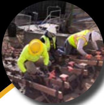
Above: Construction workers lay framing for the stairs at the southwest corner of the new Student Center. Left: Framing is being laid for the stairs leading up to the main entrance on Wildcat Way.

FEBRUARY 2021 update for faculty & staff