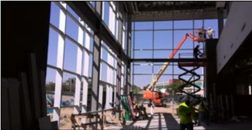
Top: Construction workers are seen laboring in what will soon be the student lounge in the Taft College Student Center. Right: Construction workers evaluate details on an interior wall installation in the soon-to-open Taft College Student Center. Below: The south side of the Taft College Student Center on track to finish in Spring 2021.